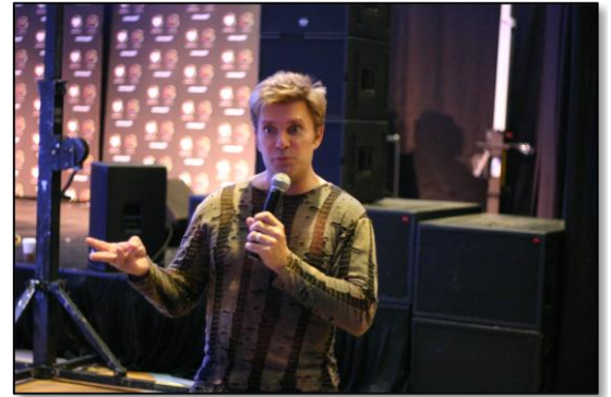
Mignogna in a question and answer session.

Finally, the word "passion" has to be used thoroughly in any description of Mignogna. It's the passion or the love of doing things that drives him. He emphatically prescribes it for everyone. "Do what you feel is unique to you and don't worry about how others see you," he explains. "You never know where anything will lead, either now or ten years from now. So do whatever is fun for you." This is something he believes. His interests weren't always popular, and he recounts being bullied in middle school for his Star Trek interests. His perseverance paid off. While fame isn't a goal for him, he recalls being recognized once on a plane by an eight year old. "Captain Kirk!," the boy proclaimed, and drew the attention of all the passengers. He remains humble. "I don't take anything I do for granted. They're all just gifts granted to me by God." He wants to give back to society by inspiring others the way he had been inspired by others. "Whatever you do, make the best you can make."